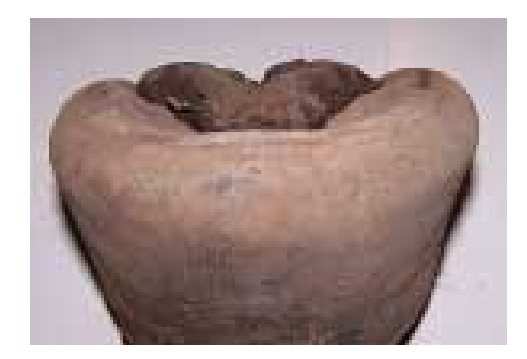
Feral cadaver: Should we trim this frog lower than the heels? Would this reduce excess frog pressure, or just overexpose the frog's corium? Or should we all pray for frogs just like this on all our horses?

That's what I love about the AANHCP's Training/Certification Program. No student is expected to be a "Jaime clone" or a "Pete clone," or a clone of any of the incredible instructors they will see. They are expected to blend the