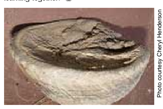
Feral horse with pathological, laid-over bars that need correction; or a new example to learn from; to accept and try to imitate?

The early pioneers of natural hoof care stepped out of the box and unlocked a startling number of mysteries for us. The number of "unsalvageable" horses salvaged is astronomical, and "the mainstream" is finally sitting up and taking notice. But now is not the time to sit back and bask in the glow of our infinite wisdom. We've only opened the door to a whole new way to learn. I think we still don't know enough to even ask the right questions yet. There's still more to this iceberg. Let's roll up our sleeves and keep learning together!