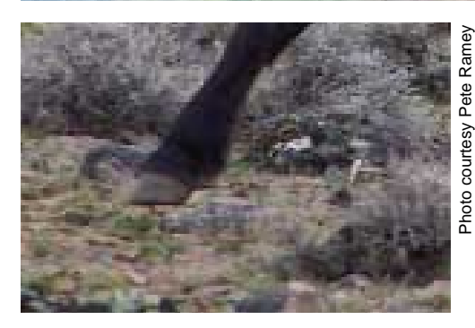
Does this HMA herd monarch need someone to lower it's heels to a natural height? Or would this cause him to be coyote bait by morning? What do you call this? "The Model" or "The Mutant"???