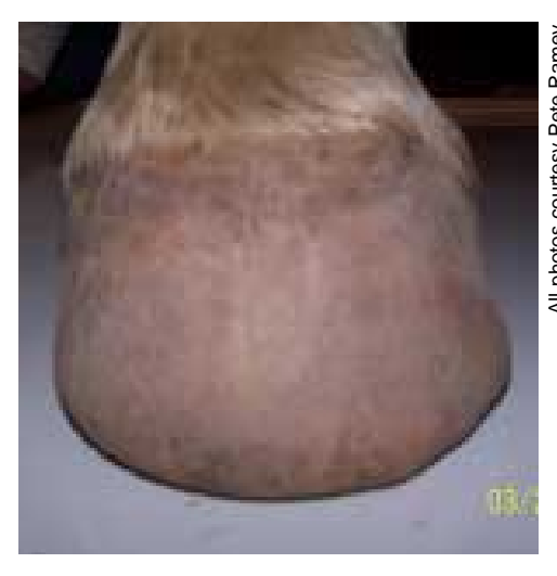
Great Basin HMA hind foot. In need of a competent trimmer to balance the foot? Or perfectly balanced for the individual's body and lifestyle?

This was one of my worst early mistakes; particularly with underrun heels. I would automatically take the heels down low, to bring weightbearing back. The resulting sensitivity would actually